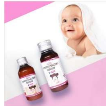
IP PLUS SUSPENSION